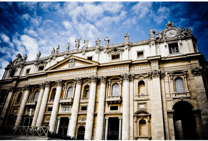
LATERAN BASILICA OF ST. JOHN